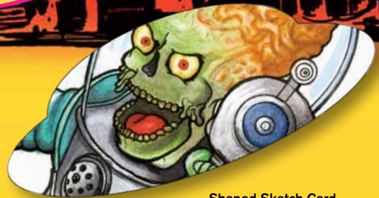
Shaped Sketch Card